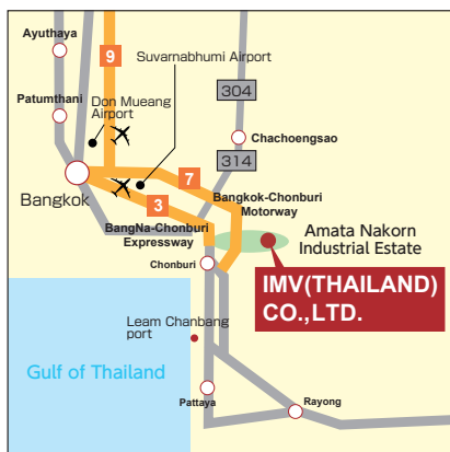
wide area map